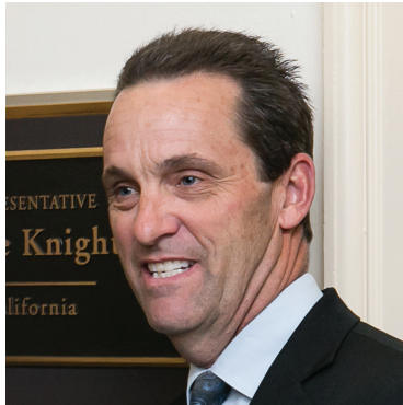
Rep. Steve Knight in his Washington, D.C. office.

She said that although three House Republicans from California—Reps. Tom McClintock of Elk Grove, Dana Rohrabacher of Costa Mesa and Darrell Issa of Vista—voted